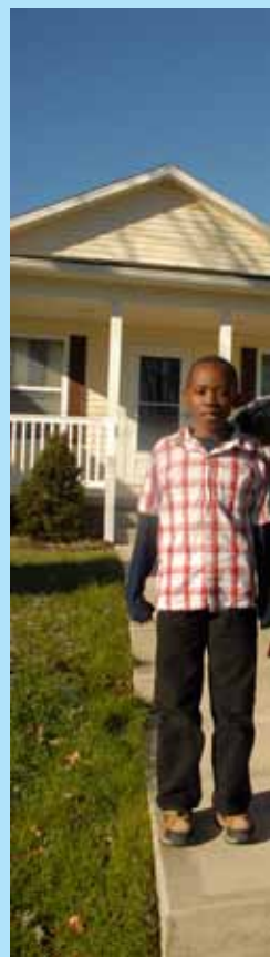
St. Mary Development Center helped [unclear] buy their first home.