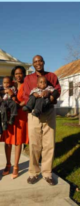
Development's HomeOwnership more than 180 families home.

Development partners ns of organizations hose in need. with others is he most efficient eate cost-effective olutions.